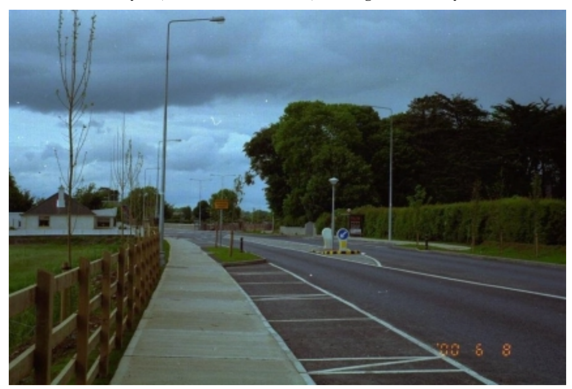
Photo 8: N20 Ballyhea, Co. Cork – Buildouts, Parking and Bus Bay 'after'